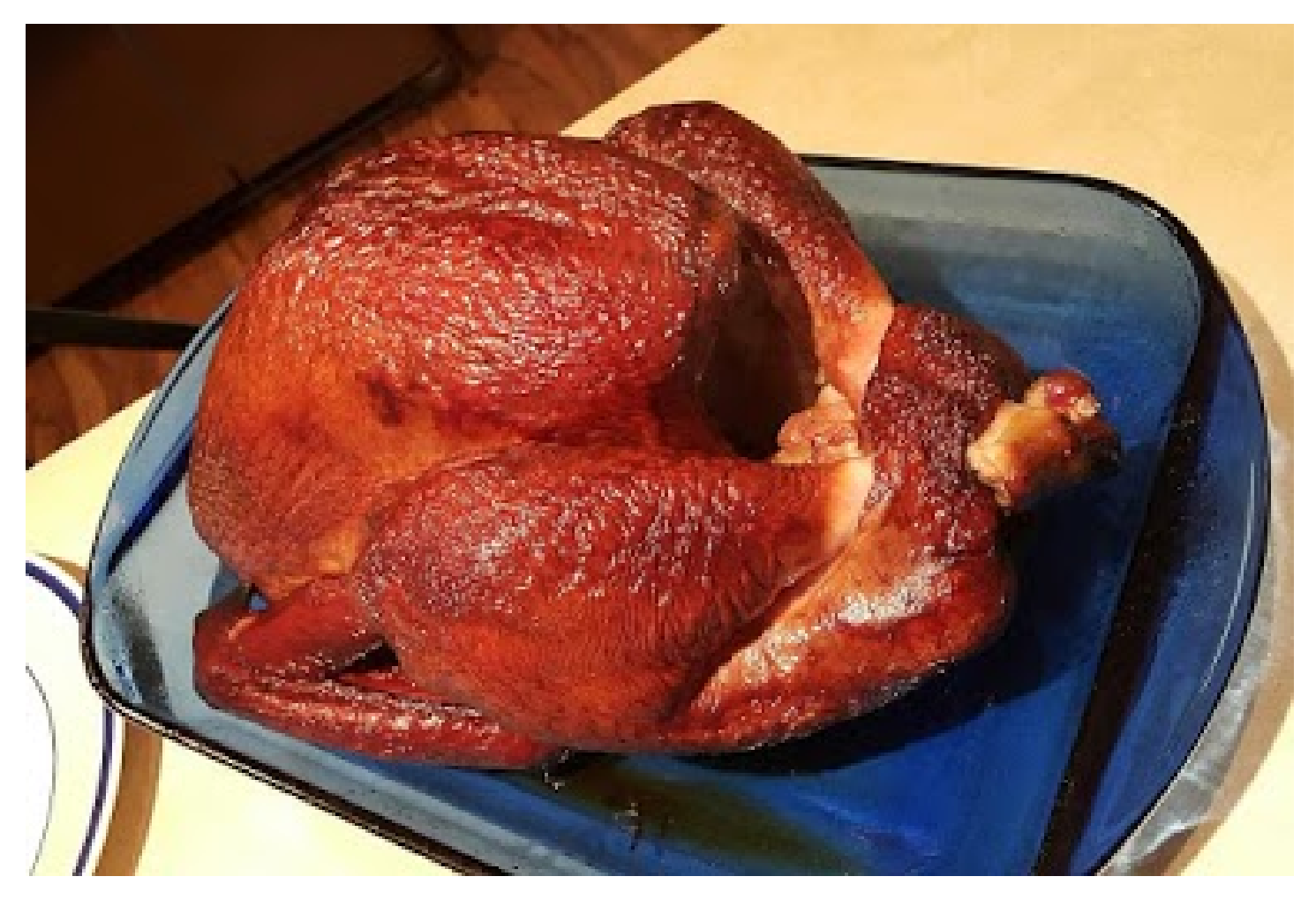
Označte jen jednu elipsu.